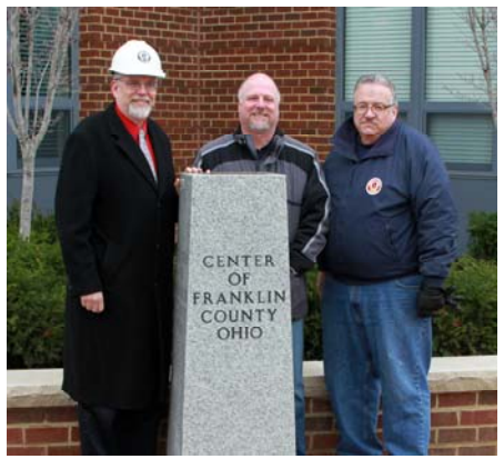
We invite you to explore our history as told through monuments and statues placed throughout Franklin County.