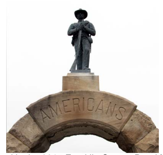
Two of the eleven monuments highlighted in the 2015 Franklin County Road Map