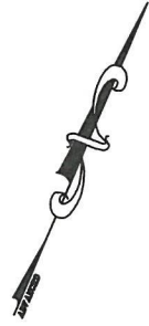
EXHIBIT-A (P. 516)

Please return this approval, along with the original description and plat of survey, as prepared by the surveyor, signed, sealed, and dated in blue ink.