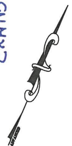
EXHIBIT - A (B 3/4)

McKinley Avenue (R/W Varies) Railroad R/W (Width Varies)