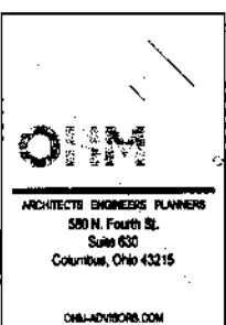
EXHIBIT B PARCEL 2-WD RIVERSIDE DRIVE EAST SHARED-USE PATH SECTION 1