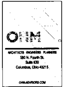
EXHIBIT B PARCEL 4-WD RIVERSIDE DRIVE EAST SHARED-USE PATH SECTION 1