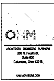
EXHIBIT B PARCEL 13-WD RIVERSIDE DRIVE EAST SHARED-USE PATH SECTION 1

BEARINGS ARE BASED ON THE OHIO STATE PLANE COORDINATE SYSTEM, SOUTH ZONE (NSRS 2007), AS ESTABLISHED FROM A GPS SURVEY UTILIZING ODOT CORS STATION "COLB" PERFORMED BY OHM-ADVISORS IN 2019.