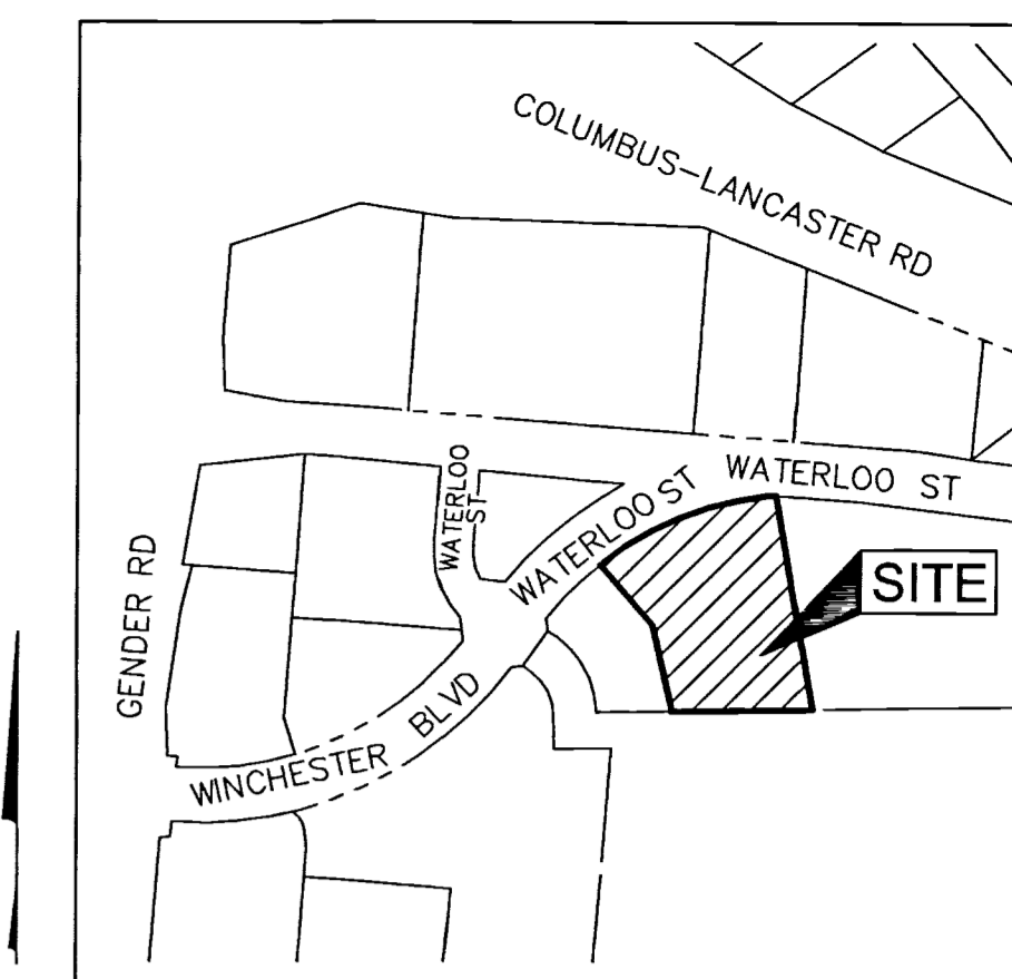
LOCATION MAP AND BACKGROUND DRAWING NOT TO SCALE