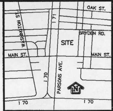
Vicinity Map (not to scale)

Posted Address: 240 S. Parsons Avenue, Columbus, Ohio