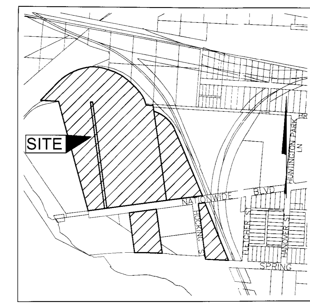
LOCATION MAP AND BACKGROUND DRAWING NOT TO SCALE

CITY OF COLUMBUS, COUNTY OF FRANKLIN, STATE OF OHIO