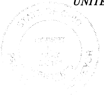
EXHIBIT OF 4.759 ACRES

Pertinent Documents: Previous Surveys Recorded deeds as shown on survey