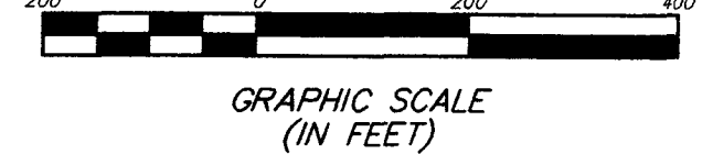
GRAPHIC SCALE (IN FEET)

I.P.S. Set are 1 3/16" I.D. Iron pipe w/ cap inscribed EMHT INC