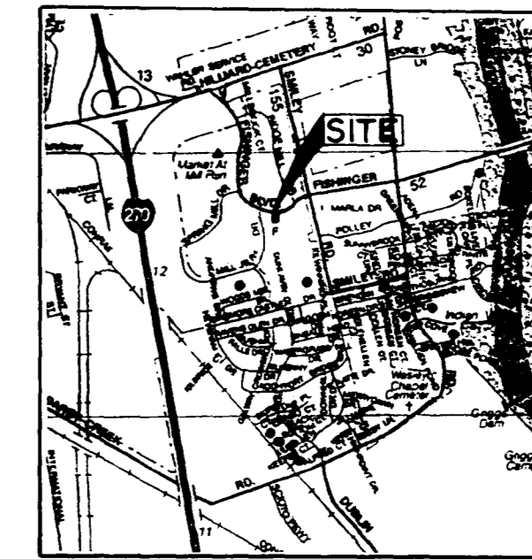
SITE MAP SCALE: 1"=1 MILE

SITUATED IN THE STATE OF OHIO, COUNTY OF FRANKLIN, CITY OF COLUMBUS, AND BEING 2.012 ACRES OUT OF PARCEL F OF "MILL RUN SUBDIVISION STREET AND EASEMENT DEDICATION PLAT" SECTION 2 AS RECORDED IN PLAT BOOK 64, PAGES 38 AND 39, FRANKLIN COUNTY RECORDER'S OFFICE.