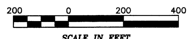
SCALE IN FEET

P:\2002\1\10010101\Survey\Draw\1_5610102.dwg JAN 06, 2000 TIME: 2:43 PM