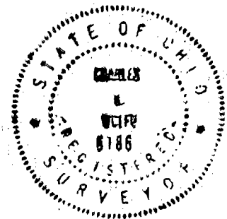
EXHIBIT "A" PAGE 2 OF 2

BY: Charles R. Wolfe 11-7-95 REGISTERED SURVEYOR NO. 6186 DATE