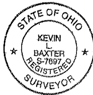
EXHIBIT FOR 0.517 ACRE PARK IN VIRGINIA MILITARY SURVEY NO. 3011, DUBLIN, OHIO

Basis of Bearings: The centerline of Rings Road, being N 83° 27' 20" E, as shown in Official Record 21915, Page H 12, Recorder's Office, Franklin County, Ohio.