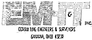
EXHIBIT A 20' ALLEY RIGHT-OF-WAY TRANSFER CITY OF COLUMBUS, FRANKLIN COUNTY, OHIO