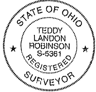
EXHIBIT FOR 0.095 AC. TRACT IN V.M.S. 2542 AT THE N.E. COR. OF FUTURE WALL ST. & PERIMETER DR. DUBLIN, OHIO FOR PERIMETER DR. R/W PURPOSES

SCALE: 1" = 100' OCTOBER 13, 1998 REV. OCTOBER 16, 1998