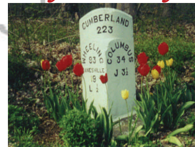
National Road Mile Marker

An All-American Road National Scenic Byway